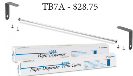
Table Paper Dispenser TB7A - $28.75

TB1CC Clear plastic tray sleeves (covers), 8 1/2" X 12 1/4", 1000 per box $25.00