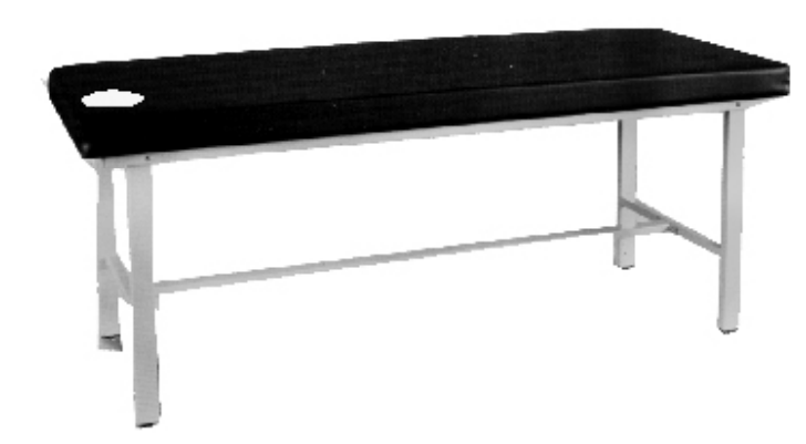
F87B (851S) Table With Shelf & Facial Cutout $425.00